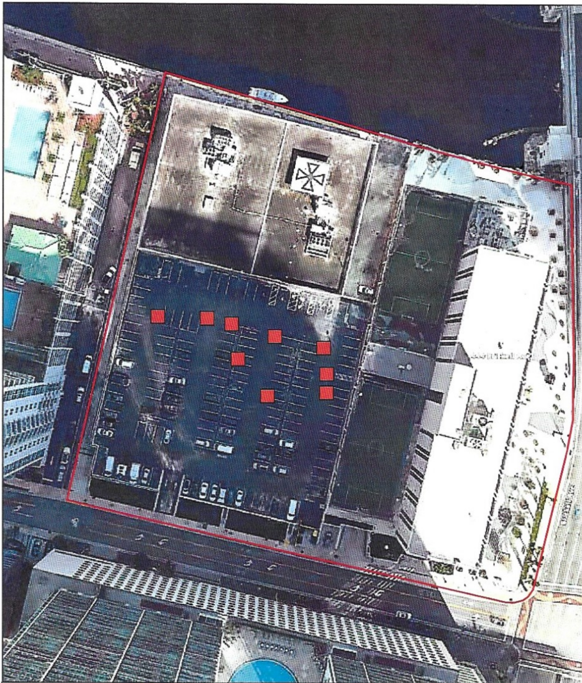
Figure 2. 444 Brickell Avenue parcel: January 2021 aerial photograph showing proposed Phase II test unit locations.