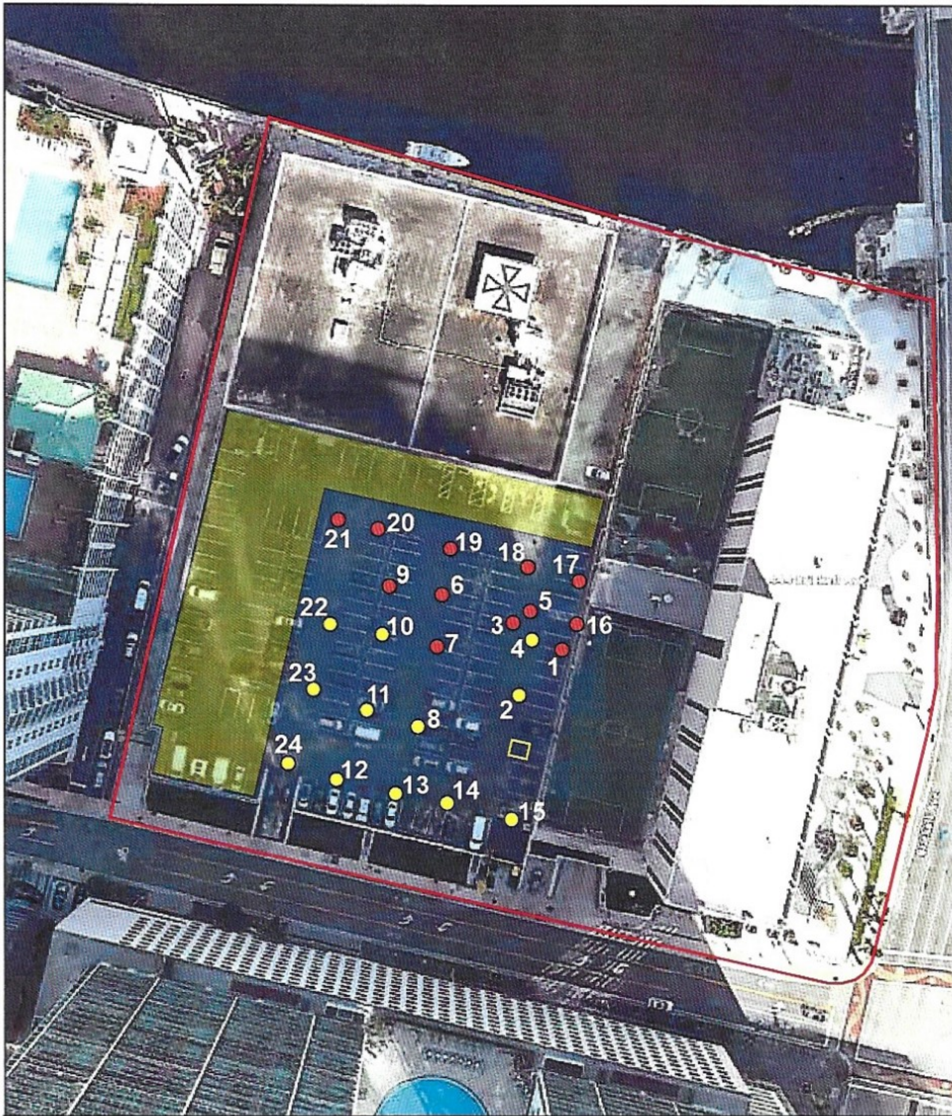
Figure 1. January 2021 aerial photograph of the project parcel showing the location of Phase I shovel tests. A concrete slab occurring on the west and north boundaries of the test area was inaccessible to testing.